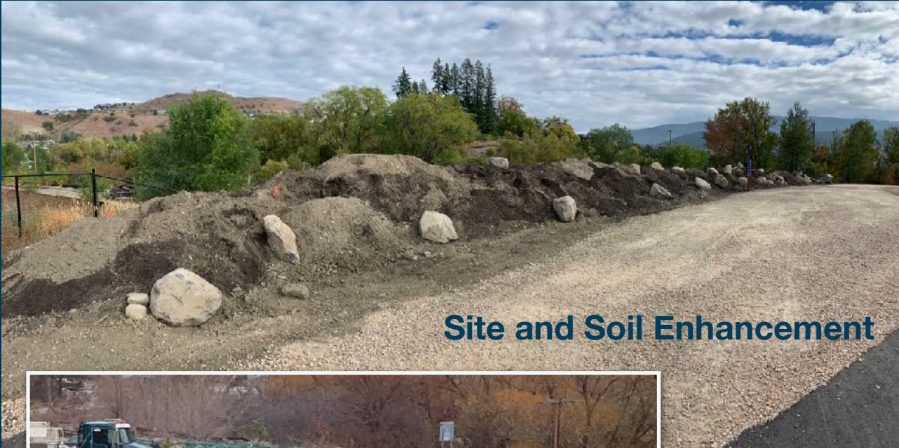
Site and Soil Enhancement