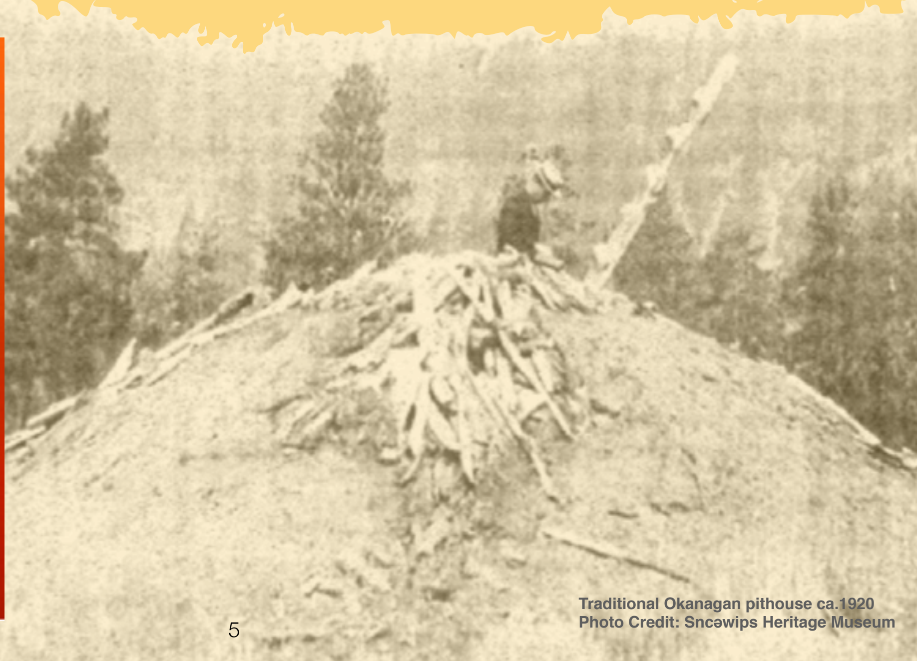
Traditional Okanagan pithouse ca.1920