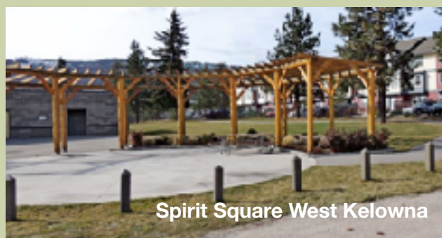
Traditional tule mat Long house